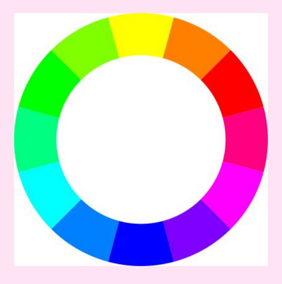
Modern Colour Wheel

If I am asked to create a design in colours that I do not normally use, I am seldom completely happy with the result because it is often alien to me, but this does not inhibit me from trying different backgrounds and threads merely because of my own perceptions. I naturally turn towards the blues/pinks and avoid the yellows/greens, but everyone sees colour differently, so select a range you find comfortable to work with.